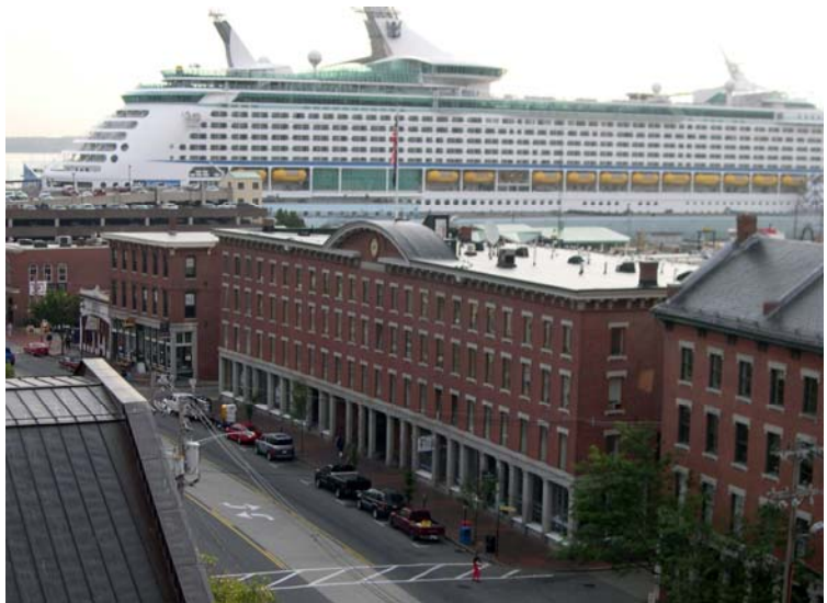
The Thomas Block at 100 Commercial Street. [September 2007] Cruise ship Explorer of the Seas is docked in the background.

Peter Harrington (207) 772-2422 peter@malonecb.com